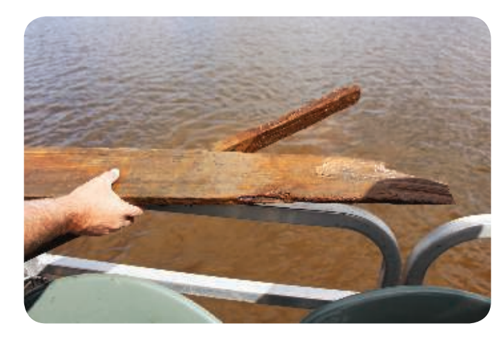
Restoring Grassy Point involves removing piles of scrap lumber left behind from Duluth sawmills over a century ago.

Construction is expected to be completed in December 2020, and Barr is currently providing construction administration, engineering, and quality control. For more information, contact Ben Meemken at 952-832-2986 or bmeemken@barr.com.