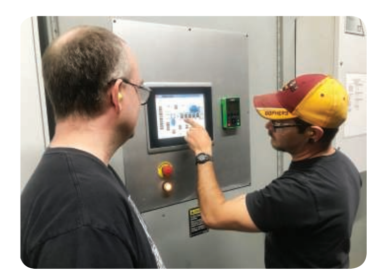
MDI employees monitor the drive and control panels that replaced four display panels and over 80 push buttons, improving reliability and efficiency.

engineering and EPCM services, contact Joe Vespa at 218.262.8622 or jvespa@barr.com. ■