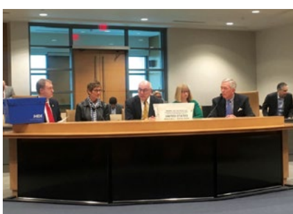
MN HOUSE & SENATE hearings were conducted in support of state funding for MDI.