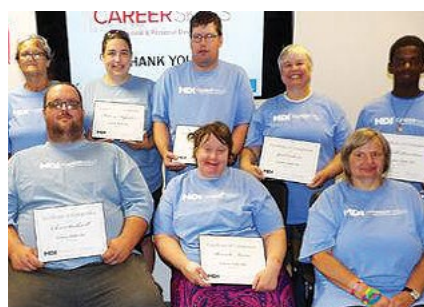
CAREER SKILLS expanded to include members of the community and outside organizations.