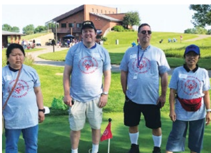
SPECIAL OLYMPICS MN held a golf tournament and 21 MDI employees volunteered in support of Unified Sports.