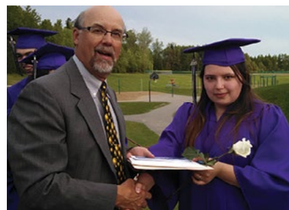
COLLEGE SCHOLARSHIPS were provided to students across Minnesota. This was MDI's seventh year providing these funds.