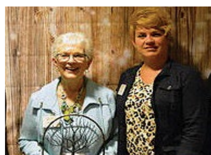
HIBBING BUSINESS OF THE YEAR & Charles K. Blandin Community Giving awards were received.