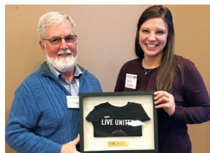
THE UNITED WAY COMMUNITY GIVING AWARD was received for outstanding MDI employee contributions.