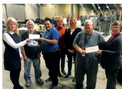
GRAND RAPIDS AREA COMMUNITY FOUNDATION provided funding for safety equipment in support of people with disabilities.